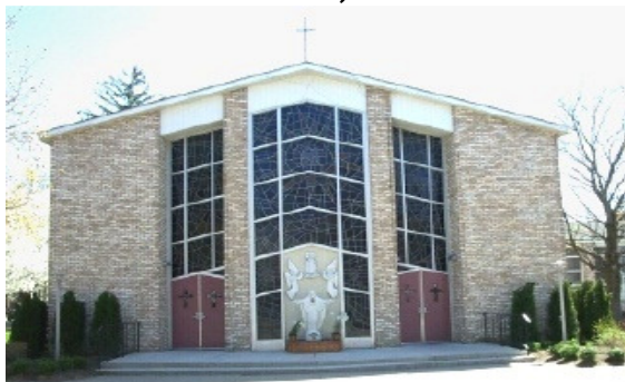
Infant Saviour, Pine Bush