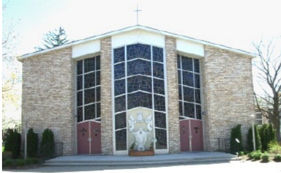
Infant Saviour, Pine Bush