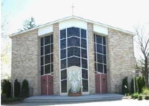
Infant Saviour, Pine Bush