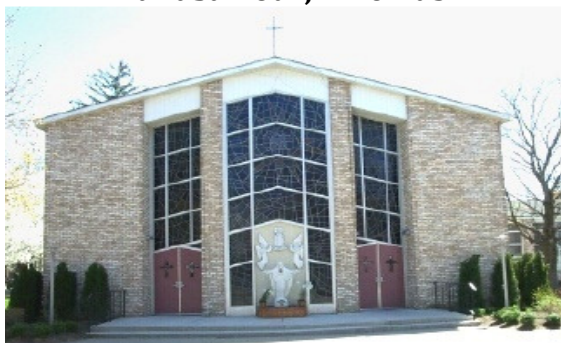
Infant Saviour, Pine Bush